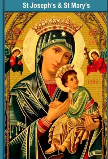
Aldershot Catholic Community

Don't just give the leftovers to God... be generous in your giving