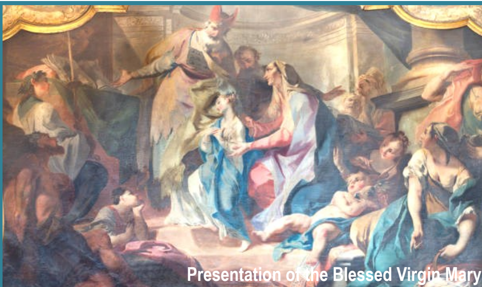
Presentation of the Blessed Virgin Mary

If you would like to request a Mass Intention, please call in at the Parish Office, Weds to Fri 10am to 12 noon, phone, or e-mail: office@aldershot-catholics.uk